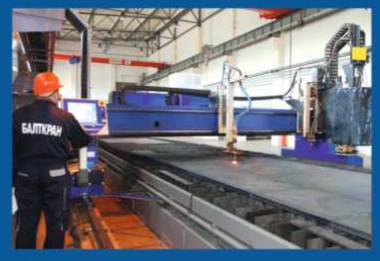
HIGH-PERFORMANCE PLASMA CUTTING MACHINE