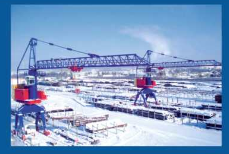
SURGUT, SWL 15 t, 20 cranes