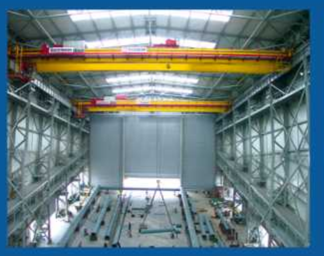
KALININGRAD, SWL 32 t + 32 t, 2 cranes