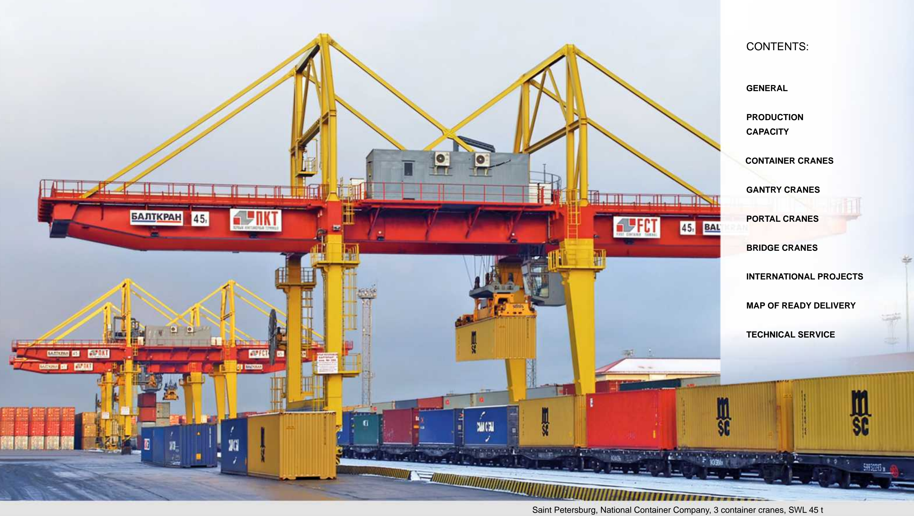
Saint Petersburg, National Container Company, 3 container cranes, SWL 45 t

The crane building company Baltkran is located in the Special Economic Zone of Kaliningrad region geographically inside of the European Union. For more than a 70-year history the enterprise has implemented technical solutions in producing more than 15000 various cranes and crane systems for transport, port, rail, gas and oil, metal, machine-building, energy, nuclear and other industries. These cranes have been faultlessly working for many years in various enterprises of Russia, the USA, Germany, France, Holland, China, India, Lithuania, Estonia, Belorussia, Kazakhstan and other countries.