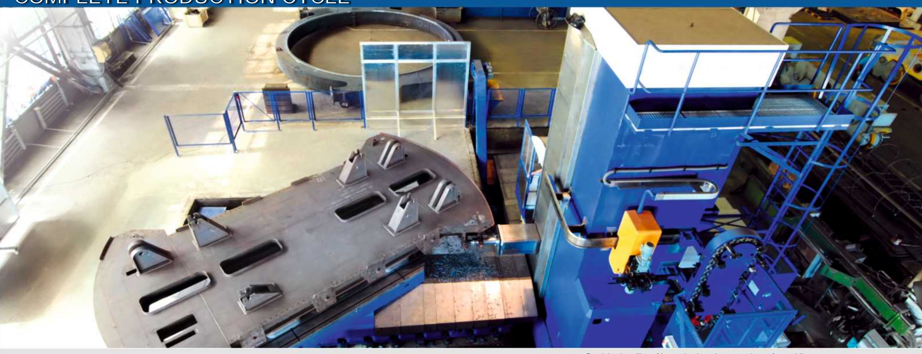
- Own innovations, research and projects;