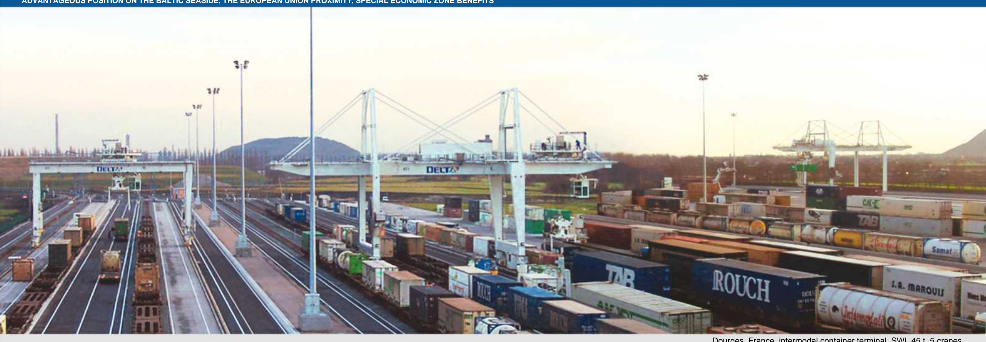
Dourges, France, intermodal container terminal, SWL 45 t, 5 cranes

ADVANTAGEOUS POSITION ON THE BALTIC SEASIDE, THE EUROPEAN UNION PROXIMITY, SPECIAL ECONOMIC ZONE BENEFITS