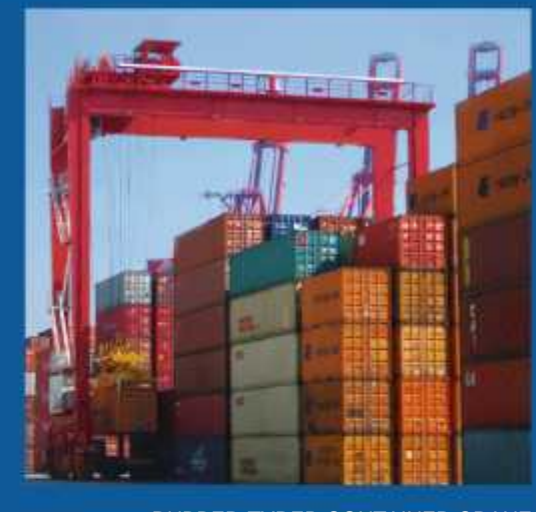
BREST, BELARUS, 4 cranes