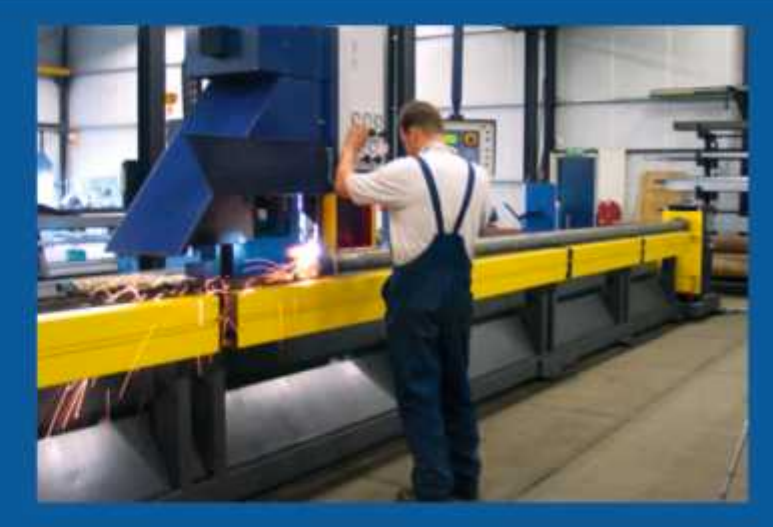
MULTIFUNCTIONAL MACHINING CENTER ENSURING HIGH ACCURACY