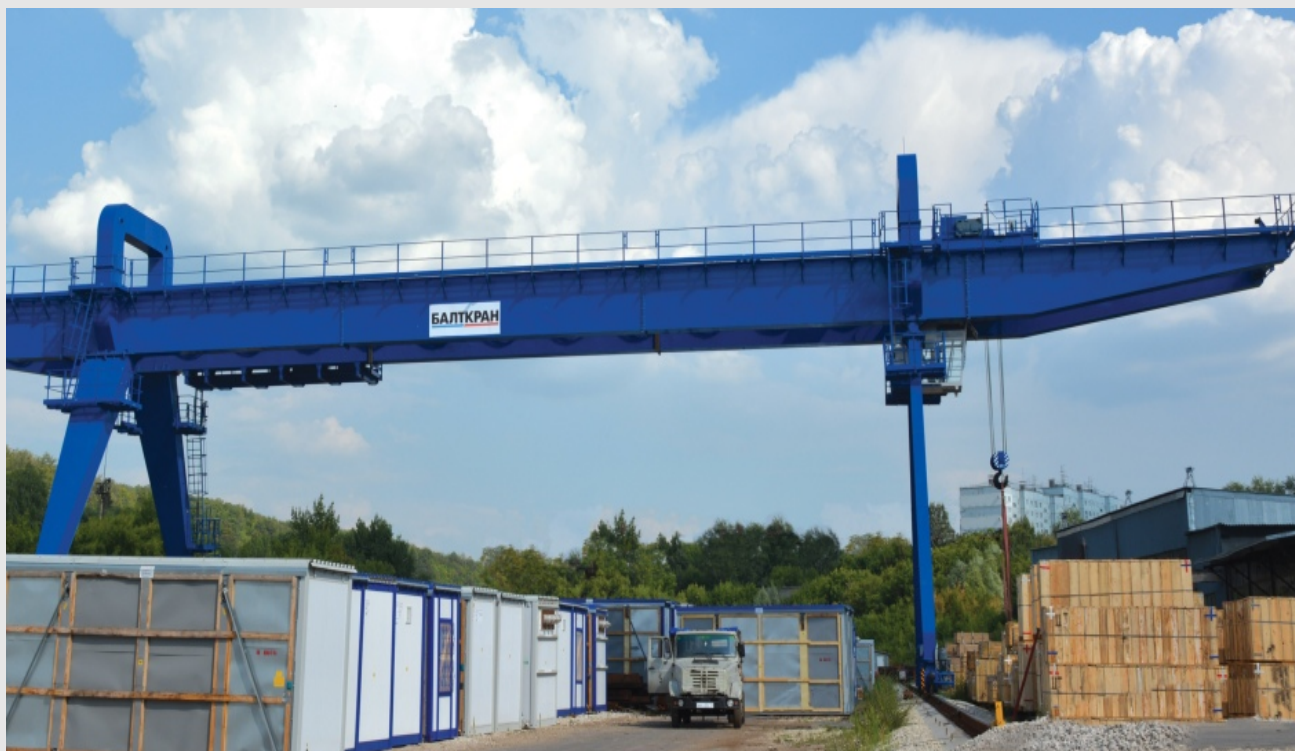
DOUBLE GIRDER GANTRY CRANE